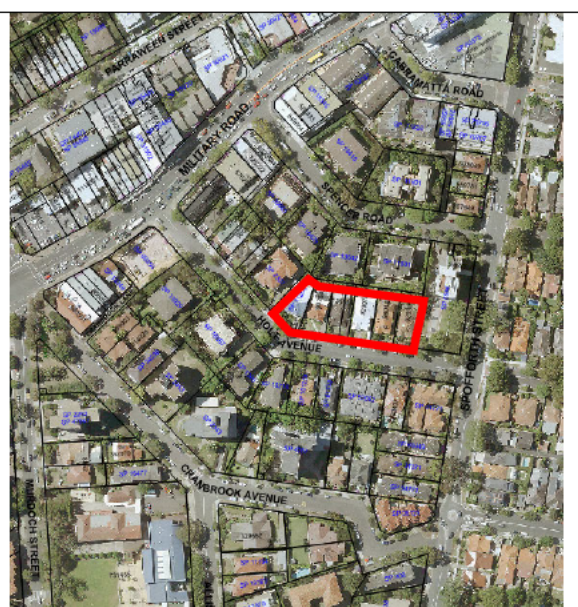
FIGURE 2: Aerial photo of subject sites